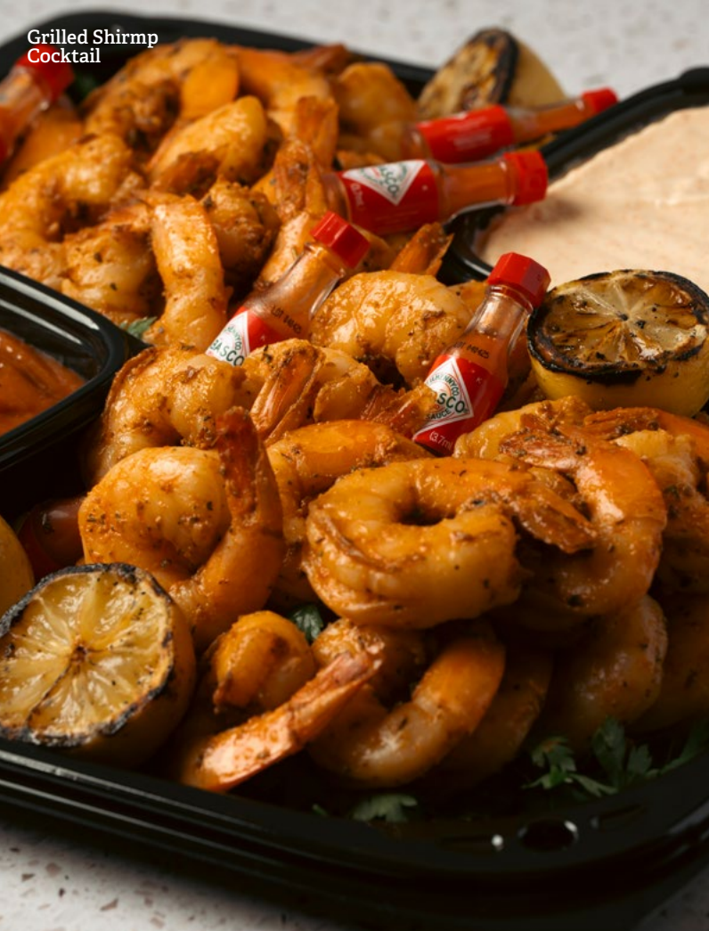
Grilled Shrimp Cocktail