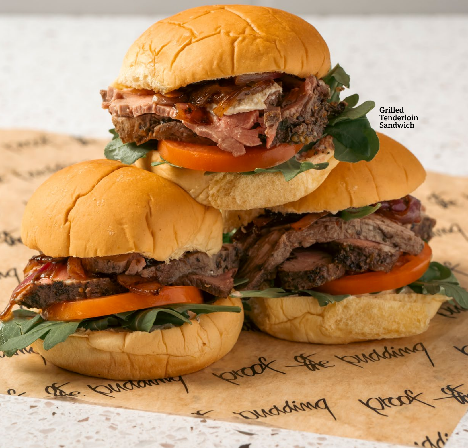
Grilled Tenderloin Sandwich