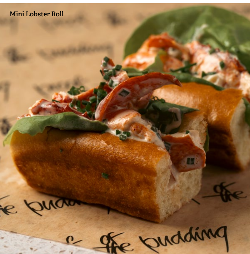
Mini Lobster Roll

butter poached lobster, lemon chive aioli, bibb lettuce, toasted bread